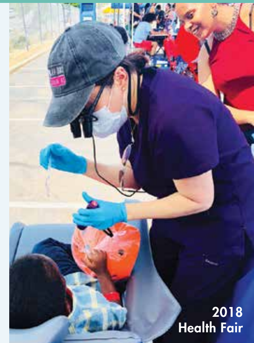
2018 Health Fair