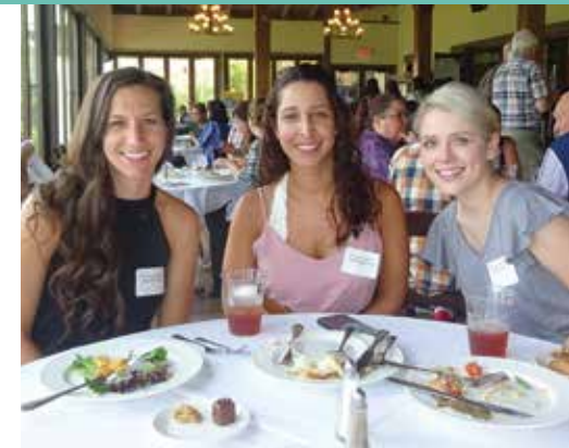
More Event photos page 14