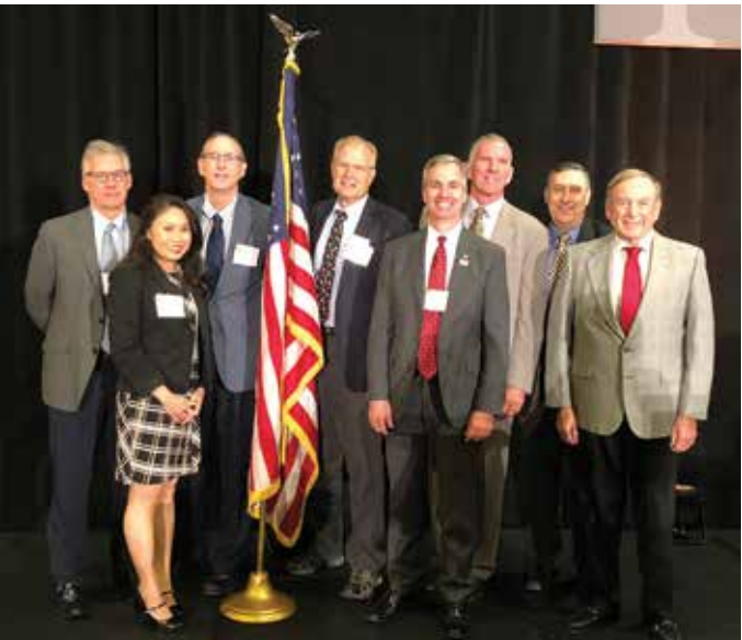
These members of our delegation to the 2018 CDA House are all veterans. Thank you for your service

To wrap this year up, don't forget to join us at our Holiday Party on December 6th at USD's Gran Terraza from 5:30 – 8:30. We'll see you there.