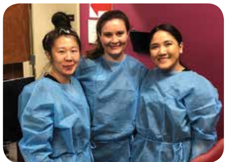
Samahan Health Centers