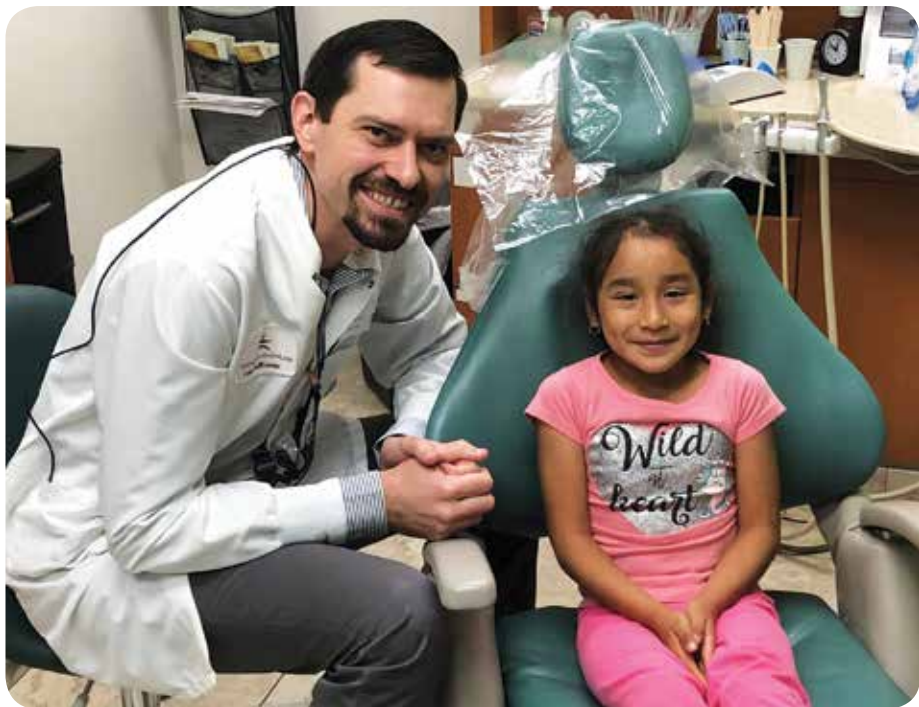
Neighborhood Healthcare Escondido