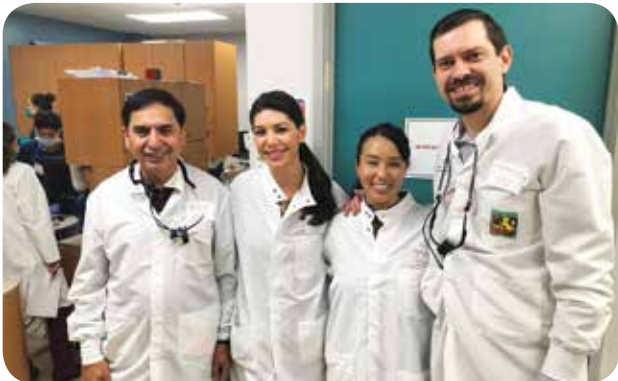
Neighborhood Healthcare Escondido