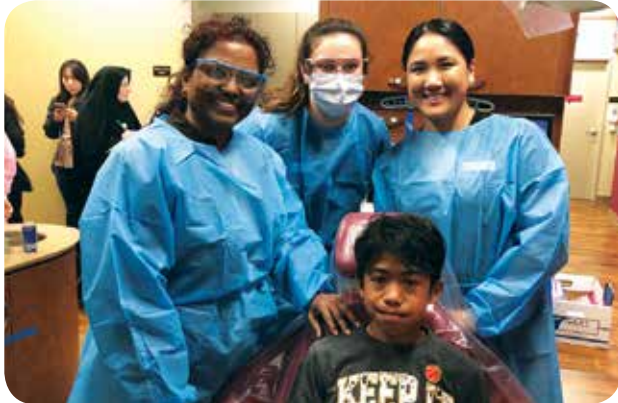
Samahan Health Centers