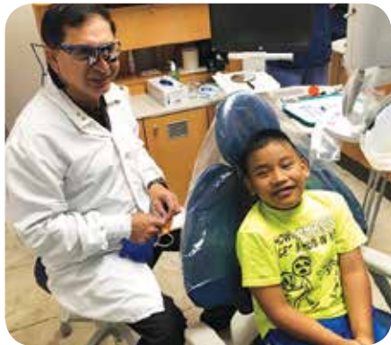
Neighborhood Healthcare Escondido