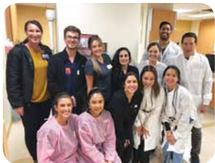
San Ysidro Health