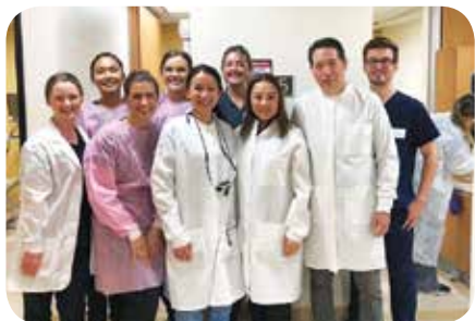
San Ysidro Health