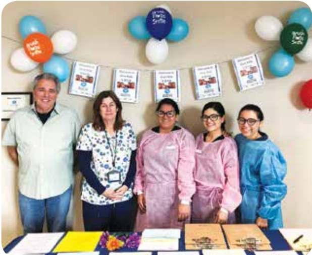
San Ysidro Health Campo