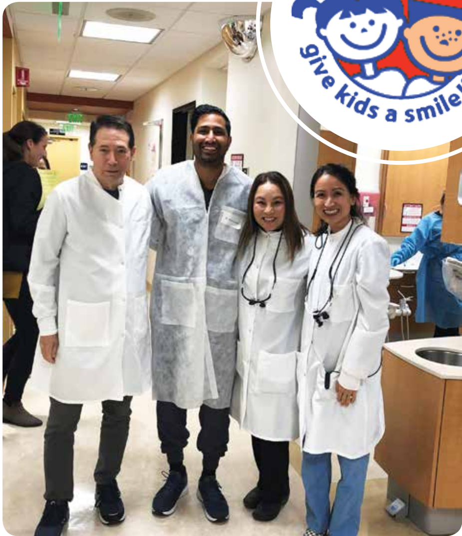
San Ysidro Health