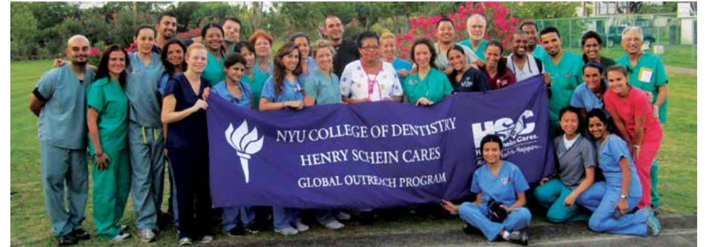
2012 - NYU College of Dentistry Grenada outreach crew! (while in dental school)

This issue is dedicated to dental outreaches!