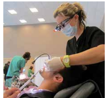
2011 - Machias, Maine outreach. Hey, don't judge the terrible ergonomics - you work with what you got!